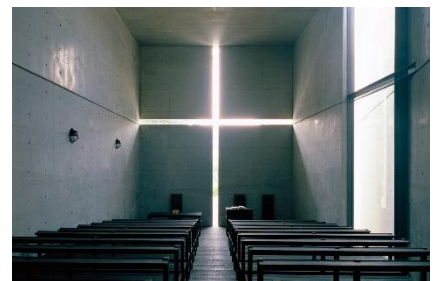
Tadao Ando Church of the Light