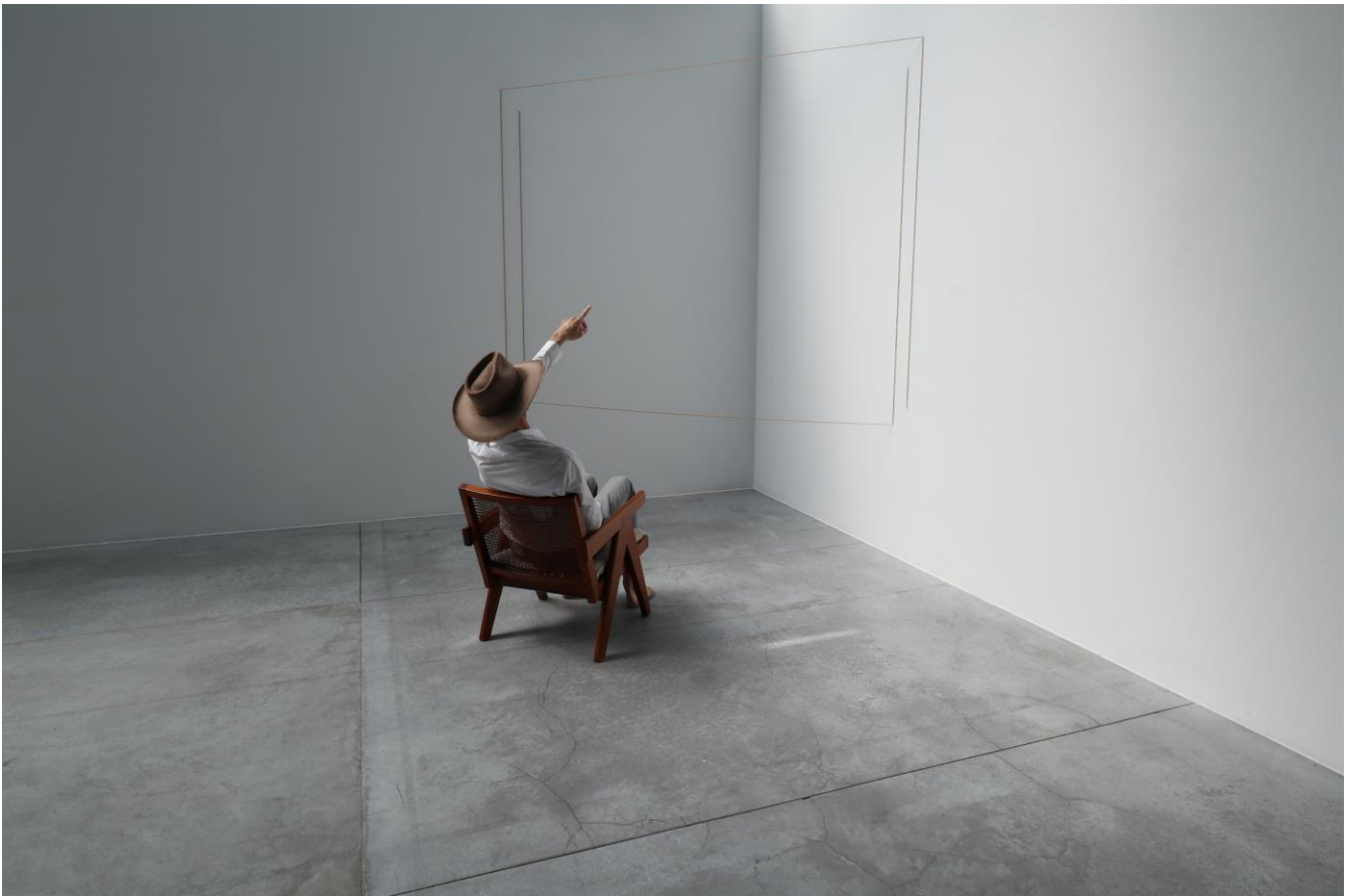
PHOTOS : TO MERGE at the CAB Fondation, february 2022 (Brussels).