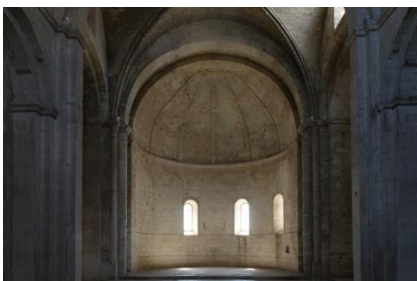
Abbey of Montmajour