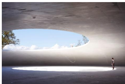
Rei Noto Matrix